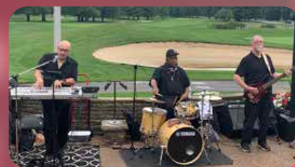
Tommy Chris Trio

Wednesday, September 30 beginning at 6:00 PM • FM ACOUSTIC